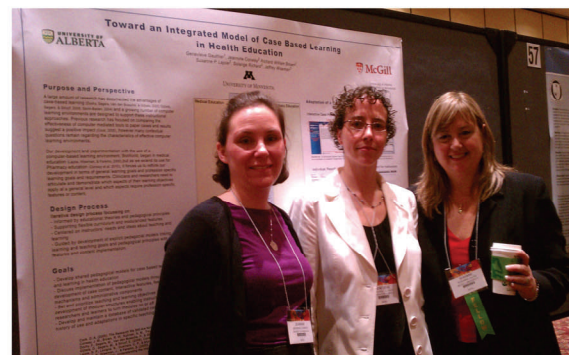
Presentation at the AERA Division I poster session